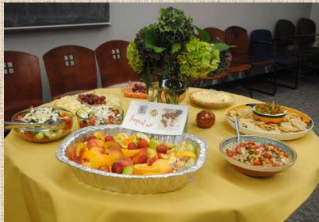
Tropical fruits and Mediterranean and Middle Eastern Cuisine