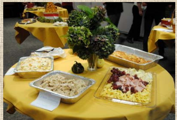
More ethnic cuisine for all the guests!