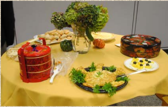
Asian cuisine treats!