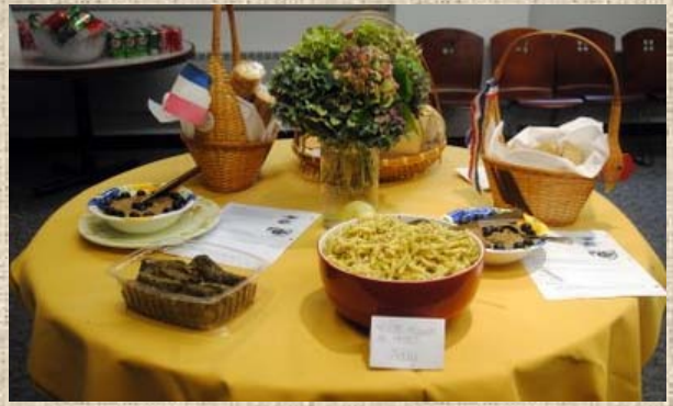
Italian and French treats!