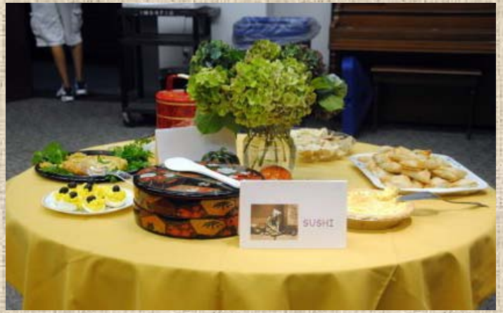
More and more delicious ethnic foods!