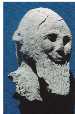
Clay head of bearded man (Royal Storehouse, Mozan, ca. 2300 BC).

LINKS: Near Eastern Archaeology Magazine Cover Article: A Channel to the Underworld in Syria Urkesh Website Backdirt Article: Beyond Clay and Beyond Paper Article in Le Monde de la Bible