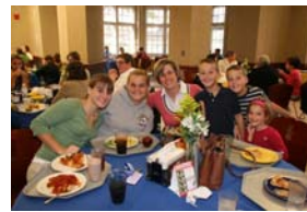
A JCU family enjoying the brunch at Parent & Family Weekend

We hope to reconnect with you on campus during this fun event...see you there!