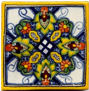
Talavera Ceramics, typical of Puebla

A four-week John Carroll University program in the heartland of Mexican culture, offering 6 hours of academic credit in Spanish and History. Puebla, the fourth largest city in Mexico, is a hub of the modern Mexican economy, and is situated close to significant rural and indigenous populations significantly impacted by the contemporary economic and social transformations associated with economic globalization. Founded in 1531 as an attempt to establish a Spanish city separate from indigenous populations, its pasts and presents illustrate the intersection of indigenous, colonial, national, and global cultures.