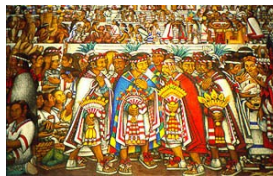
Mural at Cacaxtla

You'll be able to explore the full range of the Mexican pasts and presents in class sessions, visits as small groups to sites in