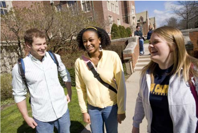
faculty members on activities other than coursework. 4

55% of FY students at least occasionally spend time with