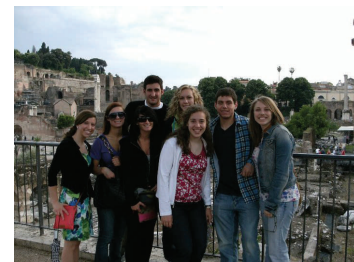
The Summer Institute 2010 students at the Foro Imperiale, the day of their arrival in Rome.