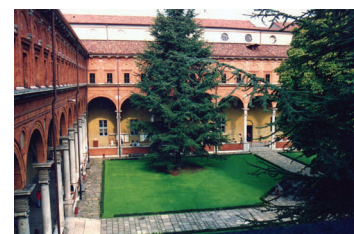
A view of the cloister inside the Università Cattolica in Milan.